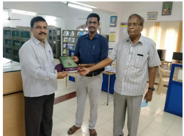
Book donation by Alumni