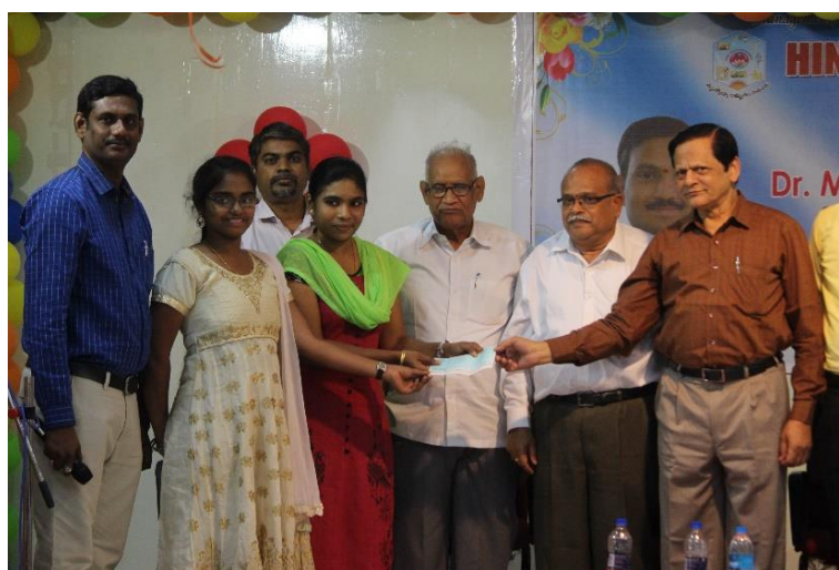
HCOP Alumni association (HAA) offered a scholarship