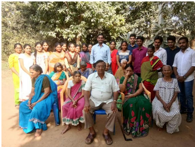
Kindness in Action: HAA Support Sainath Old Age Home Residents