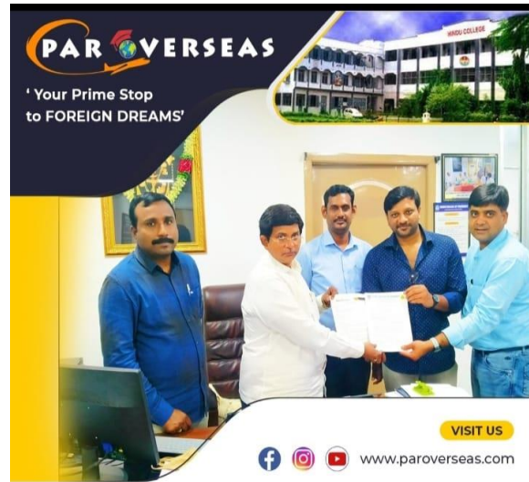
MoU with Hindu College of Pharmacy, Guntur. Congratulations PAR Team

PAR Overseas Educational and Professional Consultancy Private Limited will provide Abroad education advice, university admission, post study CV preparation, interview training and professional advice to the B-Pharmacy, D-Pharmacy and M-Pharmacy students of Hindu College of Pharmacy, Guntur, India.