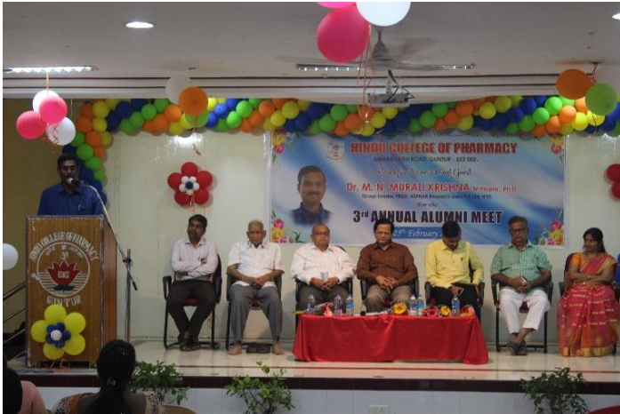
Alumni must involve in the development of the parent college