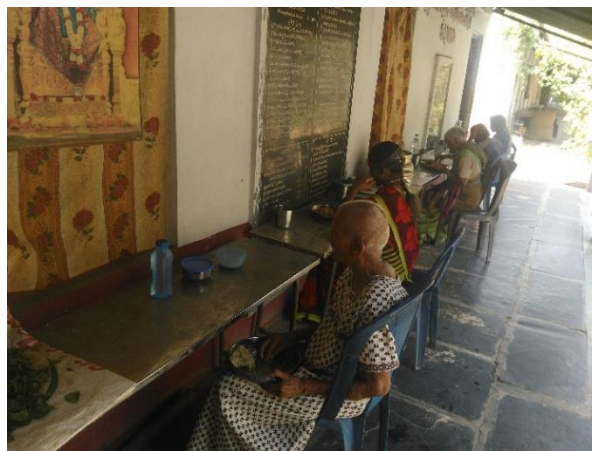
Kindness in Action: HAA Support Sainath Old Age Home Residents